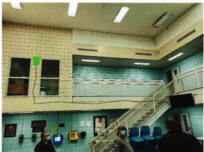
Unit 9100 WAP location and conduit run.