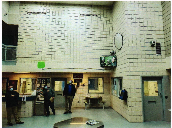
Unit 4100 WAP location.