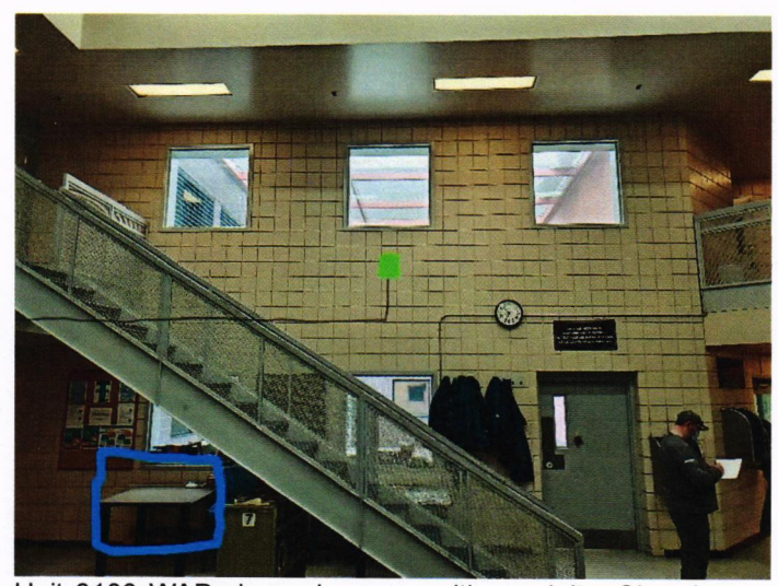
Unit 3100 WAP shown in green with conduit. Charging cart in blue. New power will be needed for the cart. 6 amps