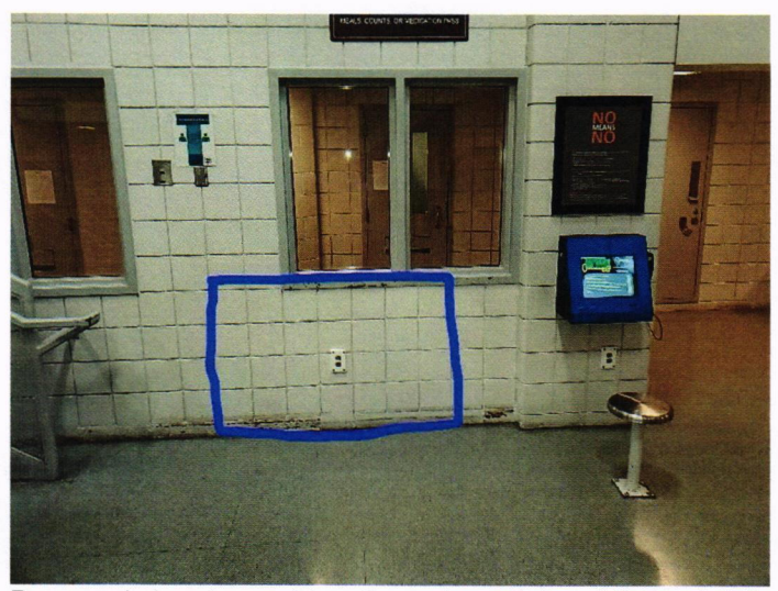
Proposed charging cart location using existing AC circuit if the circuit has 13 amps available. Otherwise, a new 20A circuit will be needed.