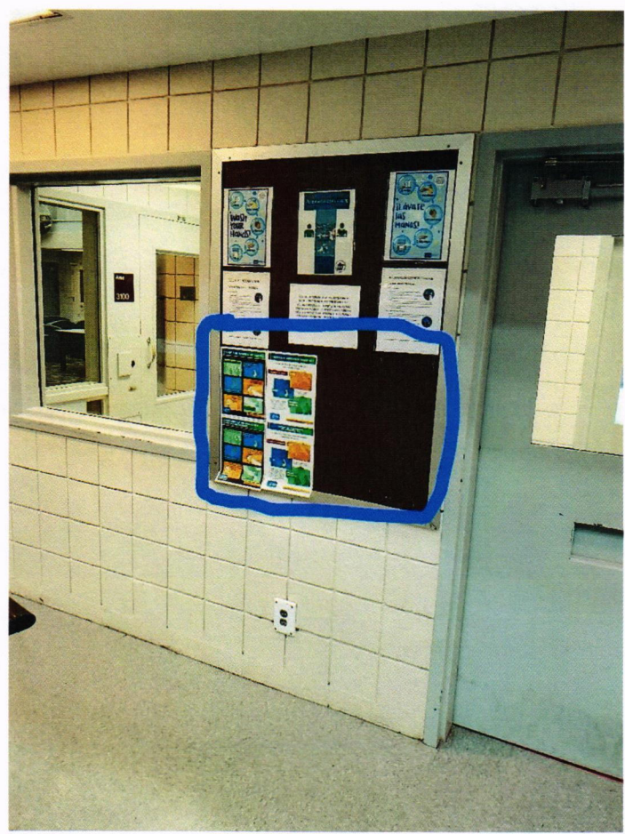
Unit 4100 charging cabinet. Bulletin board will be moved. Existing power will be used.