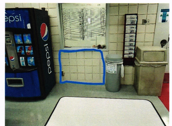
Unit 9100 charging cart location. Existing power may be sufficient.