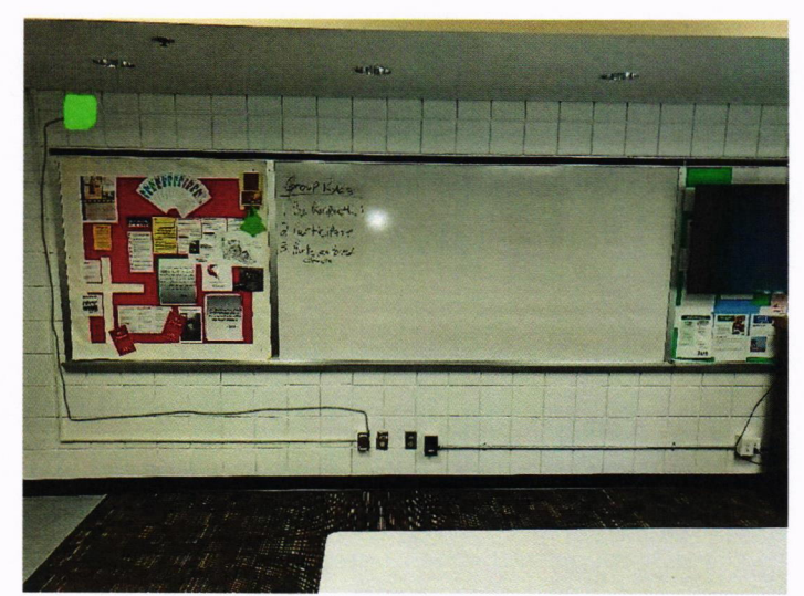
Programs area WAP and conduit location.