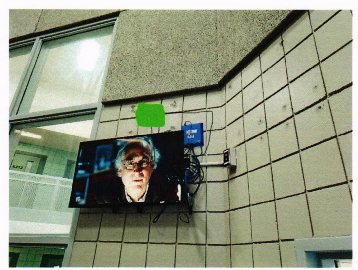
Unit 7100B WAP location.