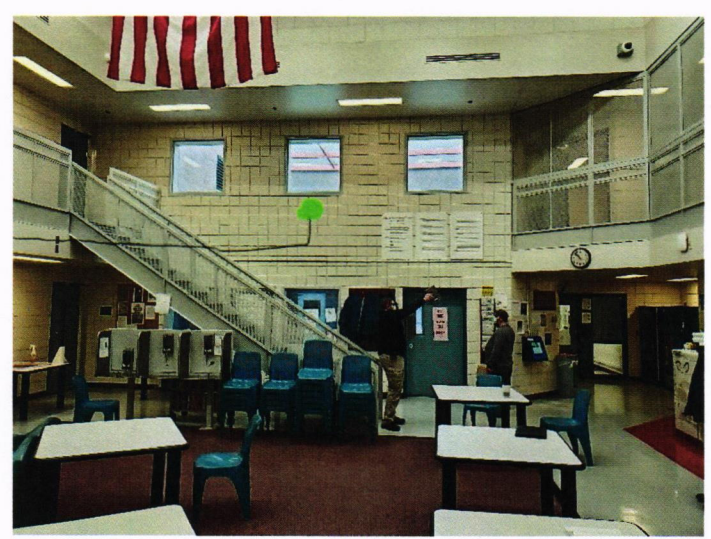
Unit 8100 WAP location. Charging cart location is to be determined.