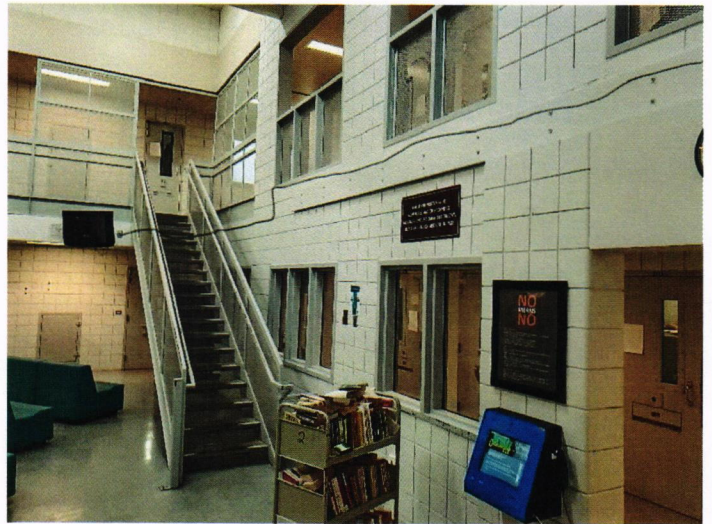
Unit 2100 conduit feed part 1.