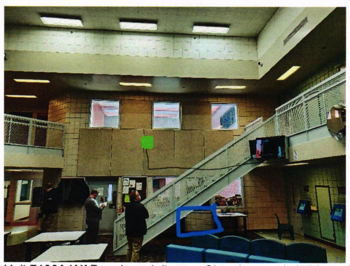
Unit 7100A WAP and conduit run. Charging cart is in blue. The cart requires 13 amps, so new power may be needed.