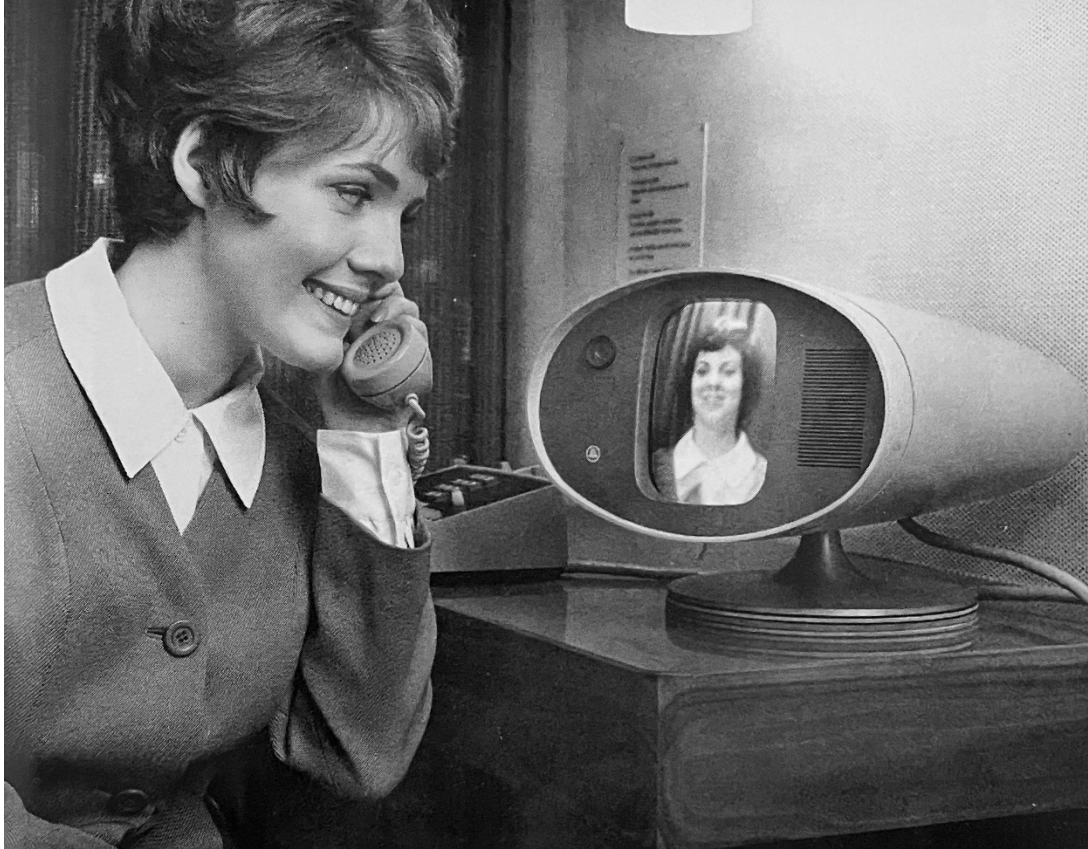
Figure 1. AT&T’s Picturephone provided video calling service in the 1960s. Although the product was a commercial disappointment, the Commission regulated Picturephone as a communication service without any serious objection.

Source: Jon Gertner, The Idea Factory: Bell Labs and the Great Age of American Innovation (2012) (reprint courtesy of AT&T Archives and History Center).