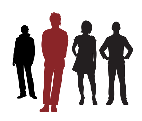
Sixty-five million U.S. adults, over one in four adults, have a criminal record.

Not only is it a matter of public safety to ensure that all workers have job opportunities, but it is also critical for the struggling economy. No healthy economy can sustain such a large and growing population of unemployable workers, especially in those communities already hard hit by joblessness. Indeed, the impact on the economy is staggering. The cost of corrections at each level of government has increased 660 percent from 1982 to 2006, consuming $68 billion a year,<sup>7</sup> and the reduced output of goods and services of people with felonies and prison records is estimated at between $57 and $65 billion in losses.<sup>8</sup>